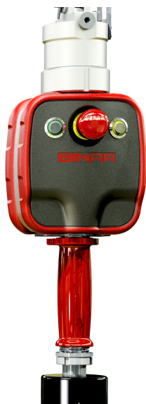
Article No: 012847

The figures are to be seen as indications and will vary depending on lifting objects.